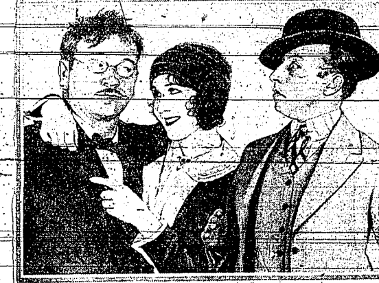
WALLACE BEERY, MARY BRIAN, RAYMOND HATTON IN "PARTNERS IN CRIME" A PARAMOUNT PICTURE