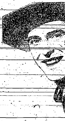
Ken Maynard in "The Wagon Show"