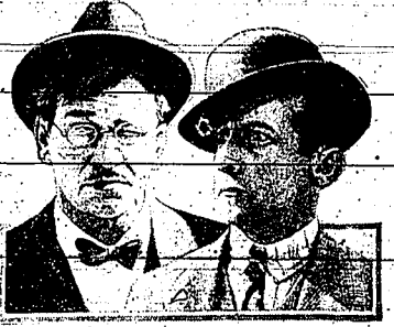
WALLACE BEERY RAYMOND HATTON IN THE FAMOUS PICTURE "PARTNERS IN LAUGHS" TODAY AND TOMORROW ONLY