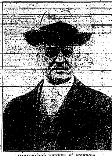
AMBASSADOR DWIGHT W. MORROW