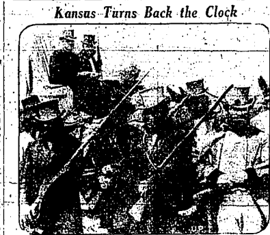
Frontier days were relived at Pawnee, Kan., when several buildings in the town that was the first capital of the state were dedicated as historic shrines. Here are shown some of the citizens in frontier costumes, who participated in the ceremony.