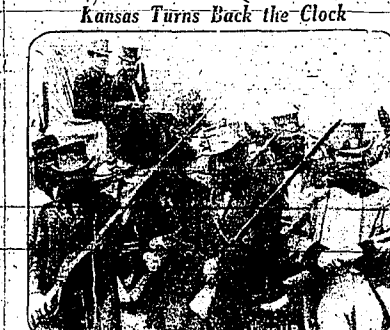
Frontier days were revived at Pawnee, Kan., when several buildings in the town that was the first capital of the state were dedicated as an historic shrine. Here are shown some of the citizens, in frontier costume, who participated in the ceremony.

All human souls never so bedarkened, love light; light, once kindled, spreads with all its luminous clarity.