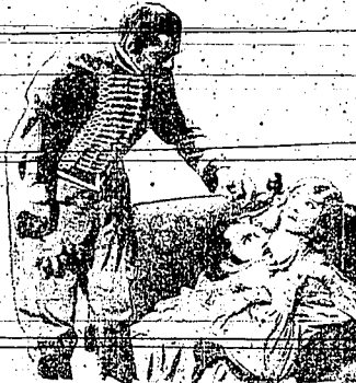
A SCENE FROM DW. GRIFFITH'S "DRUMS OF LOVE"