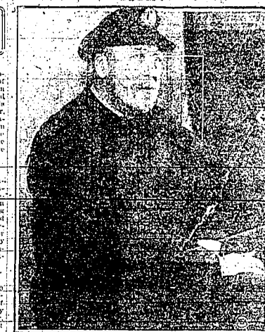
In this excellent camera study of the commander of the Great Zepplin, you can read the story of his thrilling exploits. A two-day exhibition will be shown at the Grand Hotel, starting Monday, Oct. 22, at 10 o'clock. The exhibition will be shown at the Grand Hotel, starting Monday, Oct. 22, at 10 o'clock.