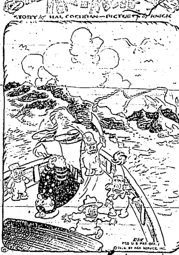
READ THE STORY, THEN COLOR THE PICTURE