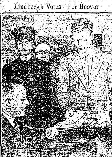
Lindbergh Votes—For Hoover

On election day, one of the officers of the club came down to Twin Falls and took away Lindbergh's ballot for an election held in St. Louis. The Lindbergh was for Hoover.