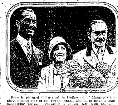
Chevalier in Hollywood

Sham-Battle Gives Audience Thrills Of Night Warfare The shell crashed and deafening roar of "Big Bertha's," the lurid glare of signal rockets, the sharp puffs of smoke from the heavy howitzers, the rattle of artillery fire, and the thrill of seeing the enemy vanquished were re-enacted every minute of the 1 1/2 hour dramatic military spectacle the "Winning of the Argonne" at the late night at the Idaho Legion. The combat brought into action more than 200 men from the 1st, 2nd, 3rd, 4th, 5th, 6th, 7th, 8th, 9th, 10th, 11th, 12th, 13th, 14th, 15th, 16th, 17th, 18th, 19th, 20th, 21st, 22nd, 23rd, 24th, 25th, 26th, 27th, 28th, 29th, 30th, 31st, 32nd, 33rd, 34th, 35th, 36th, 37th, 38th, 39th, 40th, 41st, 42nd, 43rd, 44th, 45th, 46th, 47th, 48th, 49th, 50th, 51st, 52nd, 53rd, 54th, 55th, 56th, 57th, 58th, 59th, 60th, 61st, 62nd, 63rd, 64th, 65th, 66th, 67th, 68th, 69th, 70th, 71st, 72nd, 73rd, 74th, 75th, 76th, 77th, 78th, 79th, 80th, 81st, 82nd, 83rd, 84th, 85th, 86th, 87th, 88th, 89th, 90th, 91st, 92nd, 93rd, 94th, 95th, 96th, 97th, 98th, 99th, 100th.