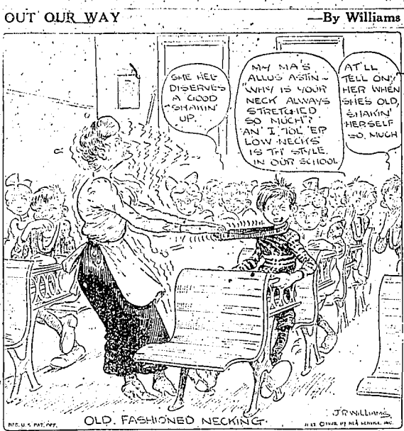
OLD FASHIONED NECKING