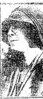
She's on Warship

When one is inclined to doubt that there is much of "a new woman" after all of that woman has a place in the scheme of things such different here than that which she ever had, one hears, for instance, that for the first time in the record records of the empire of Japan the mere wife of the emperor was privileged with him. The Empress Nagako mounted her throne the other day at the same time the Emperor Hirohito took his throne. There had, however, been 11 former empresses in their own right of blood. The empress, however, does not take her seat till the emperor has taken his. And it will really be too had if the Japanese situation is that, after all, certain tradition should be found rich to both men and women regardless.