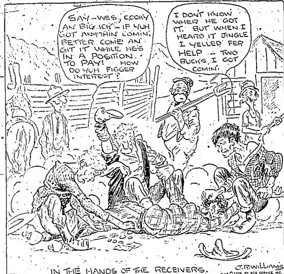
IN THE HANDS OF THE RECEIVERS.