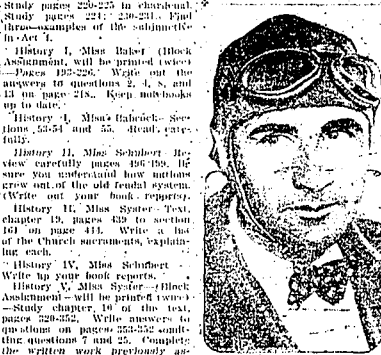
Leaping from an altitude of 4000 feet when the wings of the plane folded up, a parachute was opened and the man fell safely to the ground.

History I, Miss Scholbert - Review carefully pages 106-109. History II, Miss Scholbert - Review carefully pages 106-109. History III, Miss Scholbert - Review carefully pages 106-109.