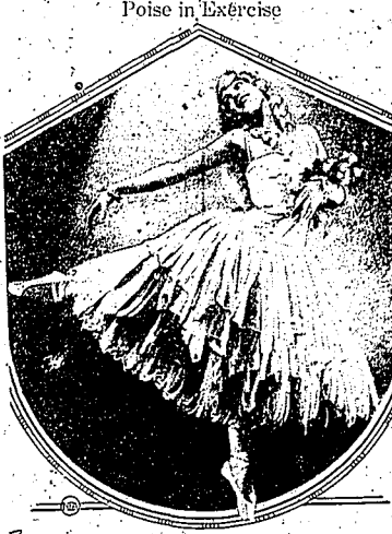
Poise in Exercise

An up-to-the-minute picture of the true agricultural condition of the West will be one of the principal aims of the sixth Western Districtal meeting of the Chamber of Commerce of the United States at Teton Falls, December 5 and 6.