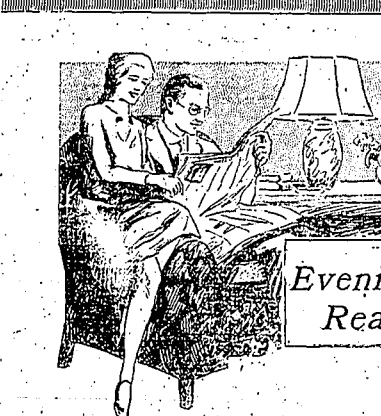
Evening Hours Are Reading Hours