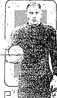
Small portrait caption.