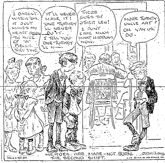
HEROES ARE MADE NOT BORN. THE SECOND SHIFT.

Female chastity is the only commodity which can command peak prices in a market where the supply exceeds the demand. The total cost of getting things in condition for the winter is a heavy bill that made it expensive.