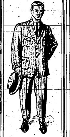
Young Men's Clothes Ederheimer, Stein & Co., Makers