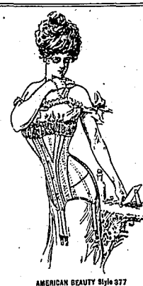
AMERICAN BEAUTY Style 377 Kalamazoo Corset Co., Makers

The American Beauty Corset The woman who wears this dainty Corset "GETS THE HABIT" and will wear no other. We have an elegant assortment from 25c up to the best. A new line just arrived.