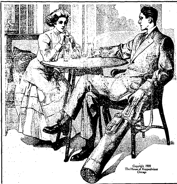
Copyright 1909 The House of Kuppenheimer Chicago

Overalls, Work Shirts, and Corduroy Pants and Suits are included in this sale.