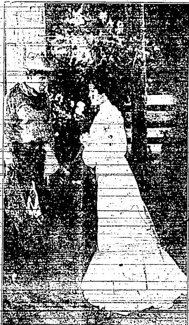
Scene from Act II, "The Virginian," High School Auditorium, February 15th.