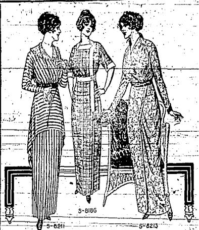
LOCAL WOMEN AGREE WITH STAGE BEAUTIES

corporation and a commercial monopoly is that its object shall be the making of money and the earning of dividends for its stockholders.