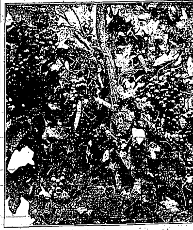
Concord Grapes in Southern Illinois. Which, Through Careful Pruning, Show a Significant Yield.

It is not enough to cut away half or two-thirds of the growth, for unless you have a proper knowledge of the pruning, there are certain rules which must be adhered to, leaving nothing to guess.