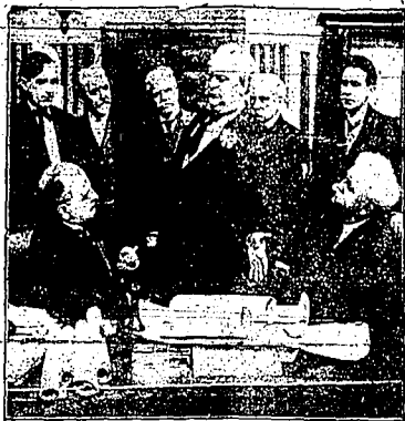
Scene from "The Gentleman from Mississippi," at the Isis Wednesday and Thursday