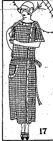
REGULAR SIZES in All Styles EXTRA SIZES in Styles 19-21-30