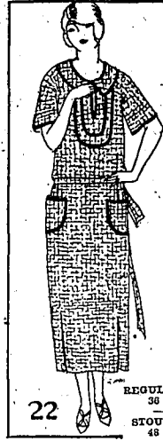
REGULAR SIZES 30 to 46 STOUT SIZES 48 to 54

Every Style and Every Size—All At One Price.