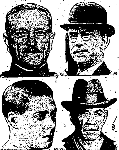
Above: GENERAL JOHN J. PERSHING and SENATOR REED SMOOT. Below: PRINCE OF WALES and ZAHOULOU PASHA.