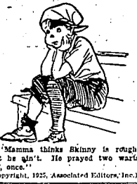
"Mamma thinks Skippy is rough but he ain't. He played two wars off, once."