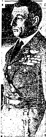
COLONEL WILLIAM E. MITCHELL Whose conviction by an army court-martial was approved by President Coolidge, has resigned his commission in the United States army.