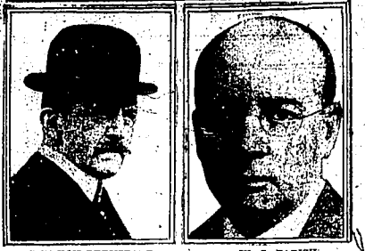
COUNT VON BERNSTORFF