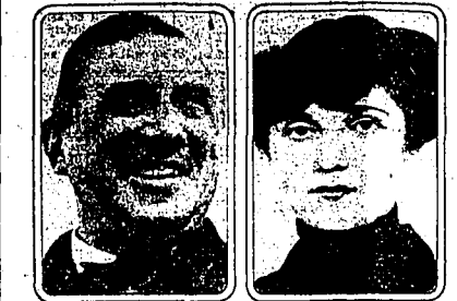
CHARLES M. SCHWAB