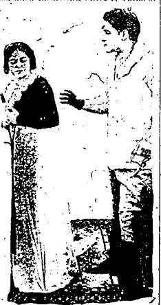
Vivian insisted on Blair's Retaining the Handcuff.

THE knights of the tournament, now frenzied with excitement, pressed on Arthur, earnestly hurring his way to the arena. These last heard of the "beast's" fortune had been the friends, comrades and admirers of Arthur from boyhood up, but the death of Dr. Lee and Arthur's flight had filled them with bitter resentment