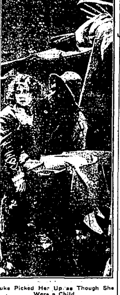
Luke Picked Her Up, as Though She Were a Child.

There, prone among the wreckage, lay Esther and Marmaduke Smythe. Esther's eyes were closed, but she had been thrown out providentially, it would seem, with a cushion from the coach that had saved her eyes from shock and bruise.