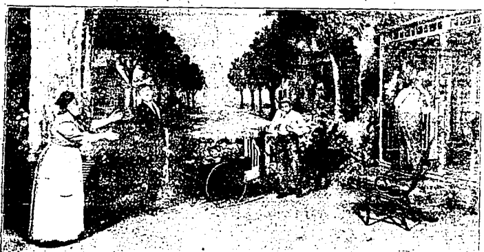
SCENE FROM THE PLAY