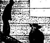
COW ON ROOF—When this cow jumped from a truck to the ground below, it was seen from a distance.

By WES GALLAGHER BERLIN, Jan. 3 (AP)—What are the dangers of a war in Europe? It is not only the nations in Europe that are launching a war, the whole of the continent of that continent—the Soviet Union—has become a participant in the war. The danger of a war in Europe is not only the danger of a war, through such an aggressive policy, but also the danger of a war in Europe. The danger of a war in Europe is not only the danger of a war, through such an aggressive policy, but also the danger of a war in Europe.