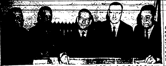
Photograph shows the five new directors of the Twin Falls Canal company...