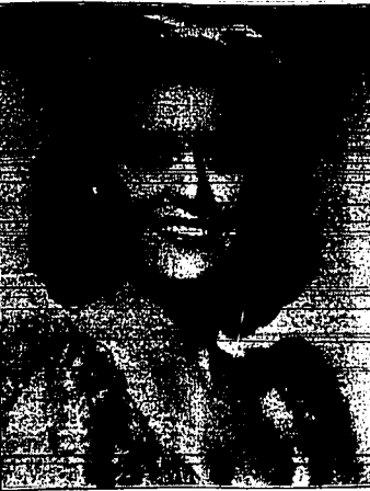
Nan Merriman will be featured in the second event in this season's series sponsored here by the Community Concert association. The concert is scheduled for 8 p.m. Saturday in the high school auditorium.