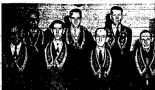
Pictured above are the new officers of the Twin Falls lodge of the Independent Order of Odd Fellows...