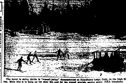
The latest in skiing tripping is 'downhill' demonstrated at Strawberry Lodge, Calif., in the high Sierra. Main idea is to hang on for dear life and let the wind provide motive power.