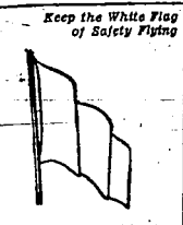
Now 64 days without a traffic death on our Magic Valley.