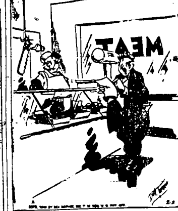
"Two pounds of hamburger, two lamb chops, a pound of liver, and mall those letters, you kafer!"