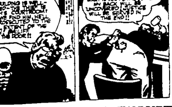
"The building is well-guarded... what is happening here..."