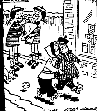
"I wouldn't be gushing over him like that if she knew I had already spent his allowance on ME!"