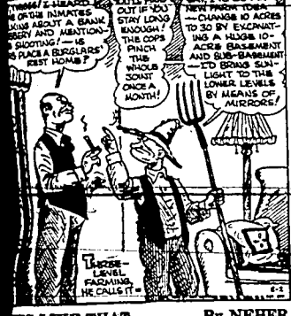
"I've got a three-foot tower... change 10 acres to 30 by excavating the top..."