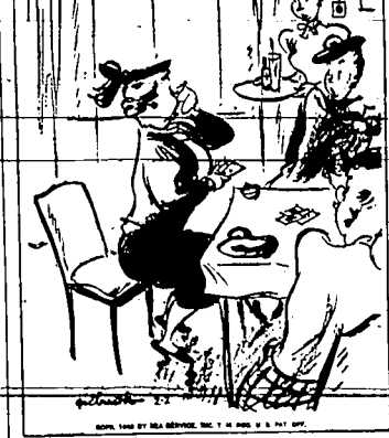
"I really should be at home with this cold, but the children come in so early from school and I don't want them to catch it!"