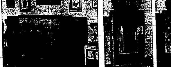
This built-in wall unit is belanned by modern painting, modern side chairs and can be dressed up with candlesticks, flower vases and books.