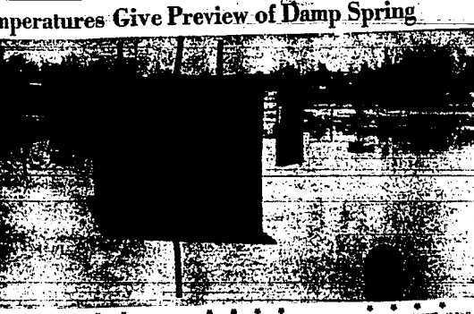
Flooded street in Twin Falls, Idaho, showing water reaching up to the second-story windows of buildings.