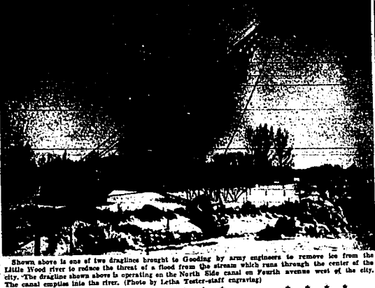
Shovelers are one of five draglines brought to Gooding by army engineers to remove ice from the river. The dragline shown here is operating on the North Side canal on Fourth street west of the city. The canal empties into the river.