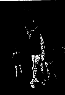
Castelford's Whyte, 35, and Kimberly's Emerson leap high in the air for a rebound in a nip and tuck South side league sub-district tournament game Monday night.