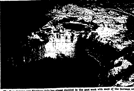
The flow of water over Shoshone falls has almost doubled in the past week with most of the increase attributed to snow and ice melting between Shoshone falls and American Falls reservoir. Present conditions indicate the peak flow over the falls may be in excess of 25,000 cfs. The flow reported in the Shoshone falls report is 10,250 cfs. Tuesday was 10,250 second feet.