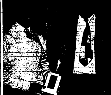
The Morningside high school basketball team received the "best" award in the South Side school sub-district basketball tournament.

Honus Wagner Feted on 75th Birthday Date CARNegie, Pa., Feb. 23 (AP) - "Old Bowlegs" celebrated his 75th birthday Thursday night, and received by the baseball world.