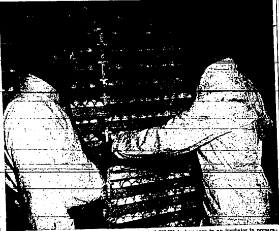
Vern Elmsner, right, and K. E. Sanderson put the first of 500,000 turkey eggs in an incubator in preparation for next Thanksgiving. About half of the 500,000 eggs to be put in the local incubator are expected to hatch.