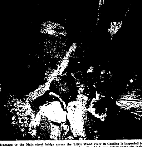
Damage to the Main street bridge over the Little Wood river in Gooding is complicated by Robert Black, high school student here. Shown is the concrete sidewalk which was raised some six inches by the force of dynamite that broke up an ice jam under the bridge. Steel reinforcement prevents the sidewalk from being torn off entirely.