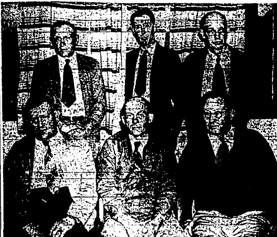
Six men were named to the board of directors of the newly formed Idaho Potato Producers' association...