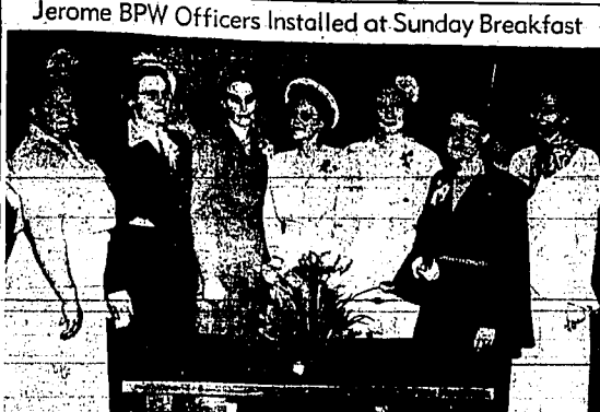
Officers installed at the Business and Professional Women's club breakfast in Jerome Sunday at the American Legion hall...