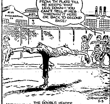
THE DOUBLE HEADER