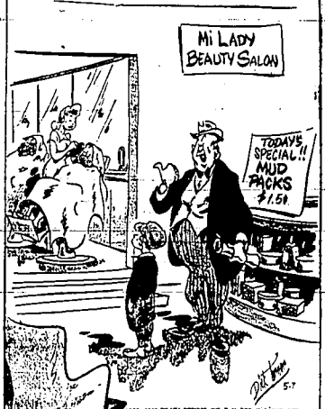
"Listen, Junior! You're used to playing in the mud - grub around and find out which one is mama!"