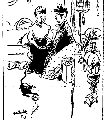
"My married daughter is so unlucky - losing those lovely leather cushions I gave her with the verses burnt on them!"