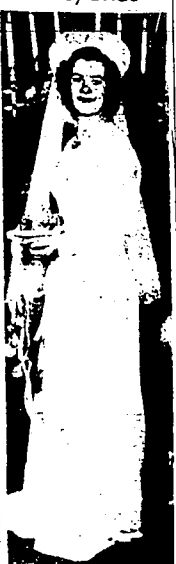
MRS. JOE HINZ (showered photo-staff engraving)

Vertical text on the far left edge of the page, including 'DUTCH BUTTER-KRUST' and 'GREATEST PAINT VALUE'.