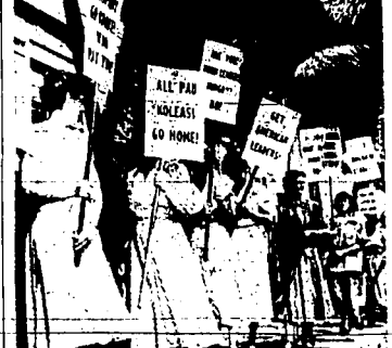
Part of a group of an estimated 300 protesting IRLWU headquarters in Honolulu, carrying signs during the end of the dock strike.