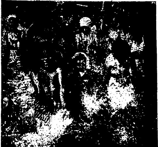
Regardless of the weather or weatherman, summer arrived officially in Twin Falls Sunday when hundreds of children flocked to the opening of the new $100,000 municipal swimming pool. Photo shows only a portion of the large crowd of youngsters splashing water. Although equipment has been purchased to heat water for the pool, no water was heated for the opening and the water was just a trifle cool.