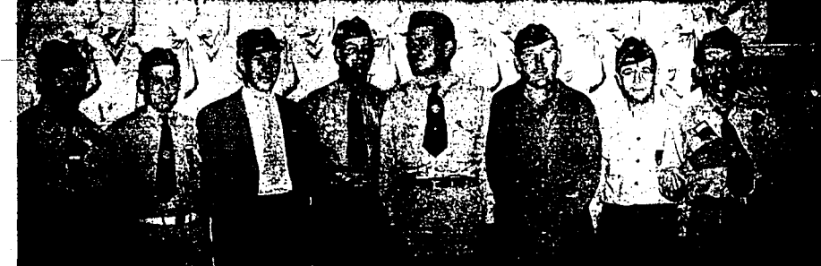
New commanders of Veterans of Foreign Wars districts in Idaho are shown after they were installed here Sunday during the closing sessions of the VFW convention.