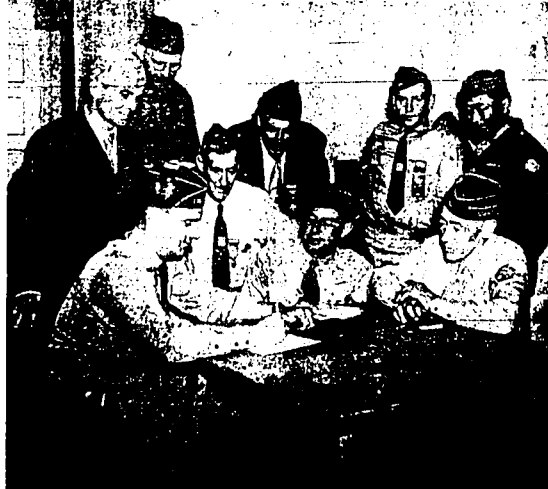
Newly elected state officers of the Veterans of Foreign Wars are shown mapping plans for the coming year of activities.