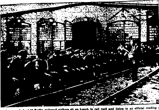
A group of about 50 Berlin railroad strikers sit on a bench in full gear and listen to an official reading a back-to-work order. The 32-day rail stoppage came to an end as these and other strikers went back to their jobs and the Soviet-directed management resumed control of west Berlin stations.