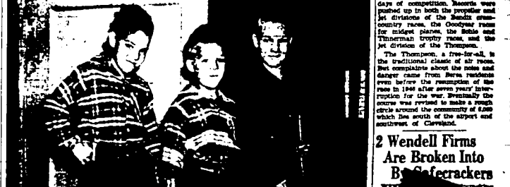
Three brothers who attended school at Idaho Falls last year returned to school at Idaho Falls today.