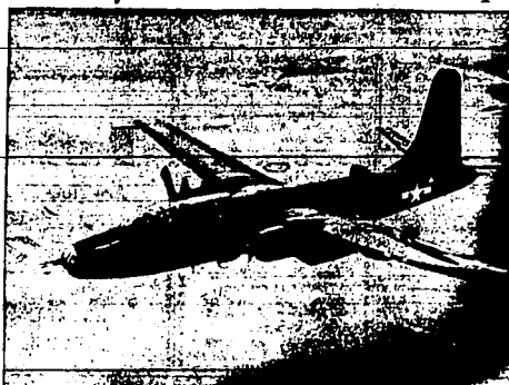
This is the navy's new patrol plane, the Martin P4M-1 Marlin, first shown to the public at the Cleveland air races. The aircraft has four engines but looks like a two-engine model. The standard gasoline engine is used for normal flight and the two jet engines, housed in the same nacelles, are used for extra bursts of speed. The Marlin is capable of speeds over 300 miles per hour and carries a load of 50,000 pounds over a 2,000-mile range. The Marlin Marlin is now in its first flight over Baltimore, Md.