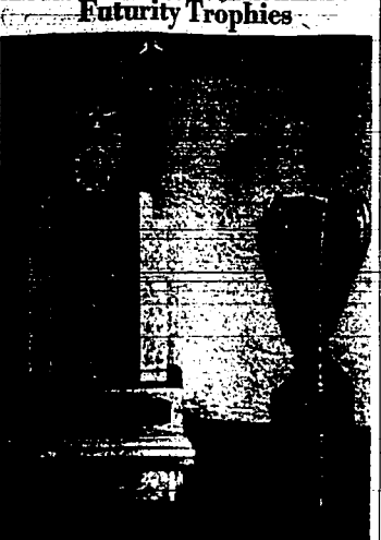
These trophies will be awarded by the Twin Falls Chamber of Commerce to the winners of the annual bull sale held Oct. 21 and 22. The trophy on the left is for first place and the cup is for second place. The bull sale is sponsored by the Idaho Cattlemen's Association.

Olson Machinery Dealers Advertisement for Olson Machinery Dealers.