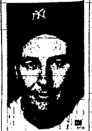
JOE PAGE brilliant relief pitcher for the New York Yankees. He saved the New York Yankees from a seventh inning loss in the seventh inning to hold the Yankees 1-0 lead.