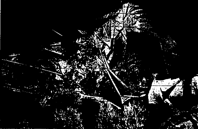
This tangled wreckage is all that remained of a light plane Sunday afternoon when the plane struck a butte, killing both occupants.