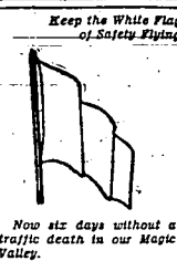
No six days without a new death at our Magic Valley.