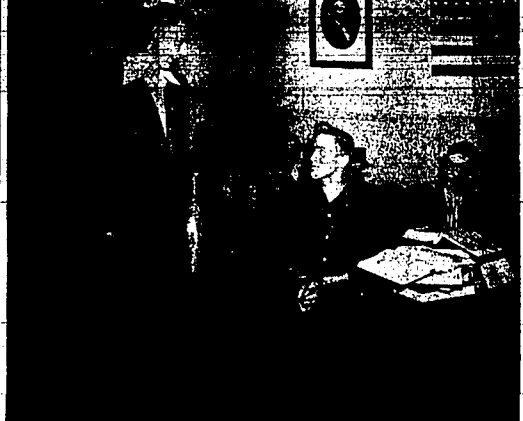
Twin Falls Junior and senior high school students had a good time Monday while occupying city offices...